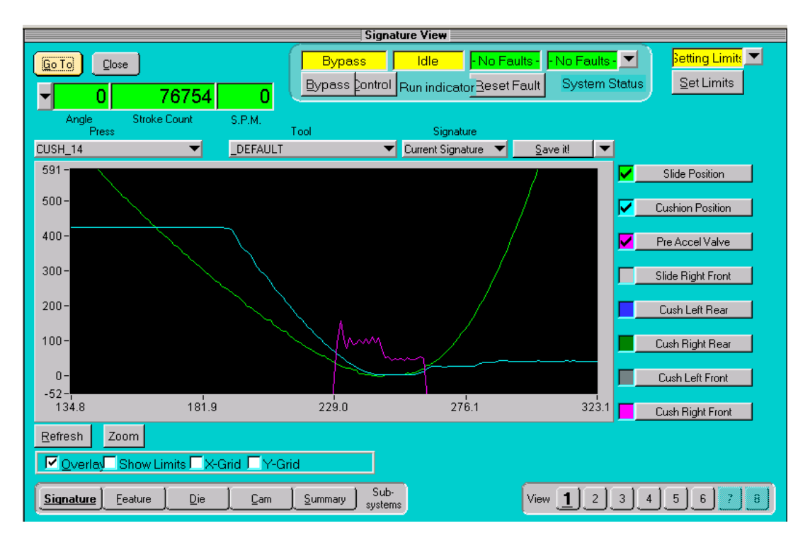
Slide position (Green) Cushion position (Lt Blue) Pre accelerate valve (Magenta)

The signatures below are taken from a Signature Technologies system used on a Large Schuler Crossbar transfer press. The system is used to monitor the lead press. Shown are the position signatures from the slide and the cushion as well as the trigger point for the pre-accelerate valve. With this tool it is possible to not only monitor the position of the slide and cushion relative to each other in real-time but also establish the trigger point for the pre-accelerate valve. When saved as a master signature the next setup is automated.